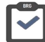
QMS / AUDITS