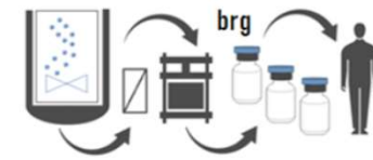
BIOPROCESS / GMP OPs