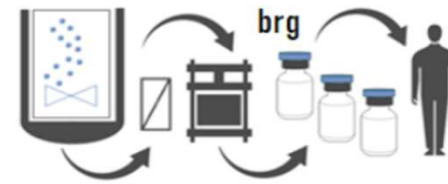
BIOPROCESS / GMP OPs