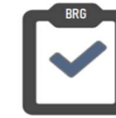
QMS / AUDITS