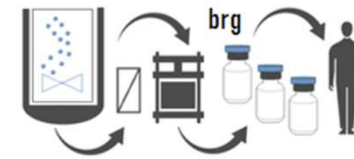
BIOPROCESS / GMP OPs