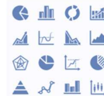
CMC / ANALYTICAL